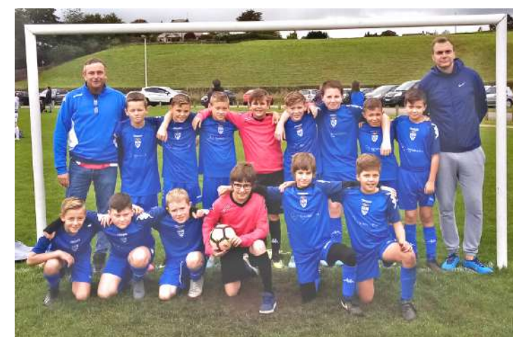
Under 12 Team 2019-2020 Season Sponsored by Mercedes Benz Carlisle