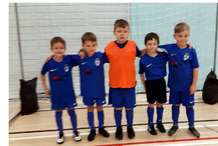
U7s At Penrith Tournament Sponsored by WM Services Construction and Maintenance