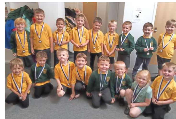
Houghton Primary School After School Club Players Receiving Their Medals - sponsored by MoynanSmith Accountants & Tax Advisers

With our club AGM fast approaching, it is great to see so many boys and girls enjoying playing for the club, and many more showing interest in playing football. Centurions are delighted to be playing their part in introducing them to the game and helping them start their football journey.