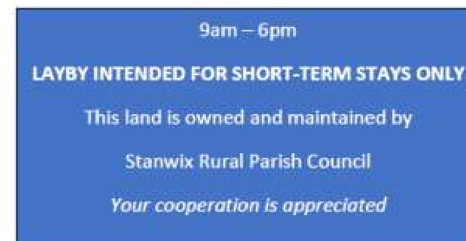
Above: The New Sign at Houghton Lay-By

Drivers are also reminded that it is an offence to leave your vehicle in a dangerous position, or where it causes any unnecessary obstruction of the highway.