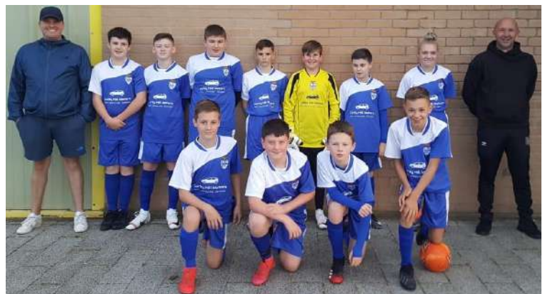
The New U 13 Team sponsored by Corby Hill Motors