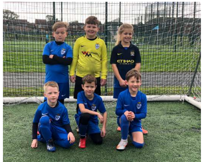
U 8 Team Sponsored by WM Services - Construction & Maintenance