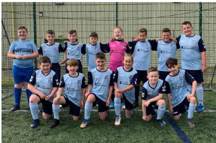
U 11 Team Sponsored by Vivax MetroTech